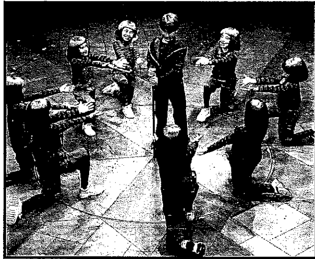
North Shore Music Theatre's Youth Academy